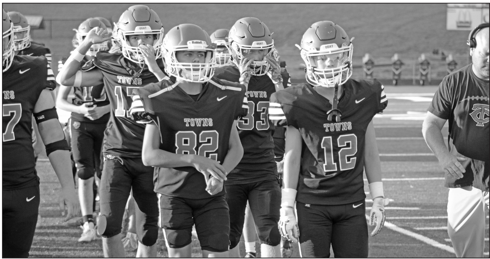
The Towns County Indians take the field at Frank McClure Stadium for the first time in 2024. The Indians rewarded the hometown crowd with a 14-0 victory and the program's first 2-0 start since 2008.

also committed 10 penalties for a total of 176 yards with 4 touchdowns called back.