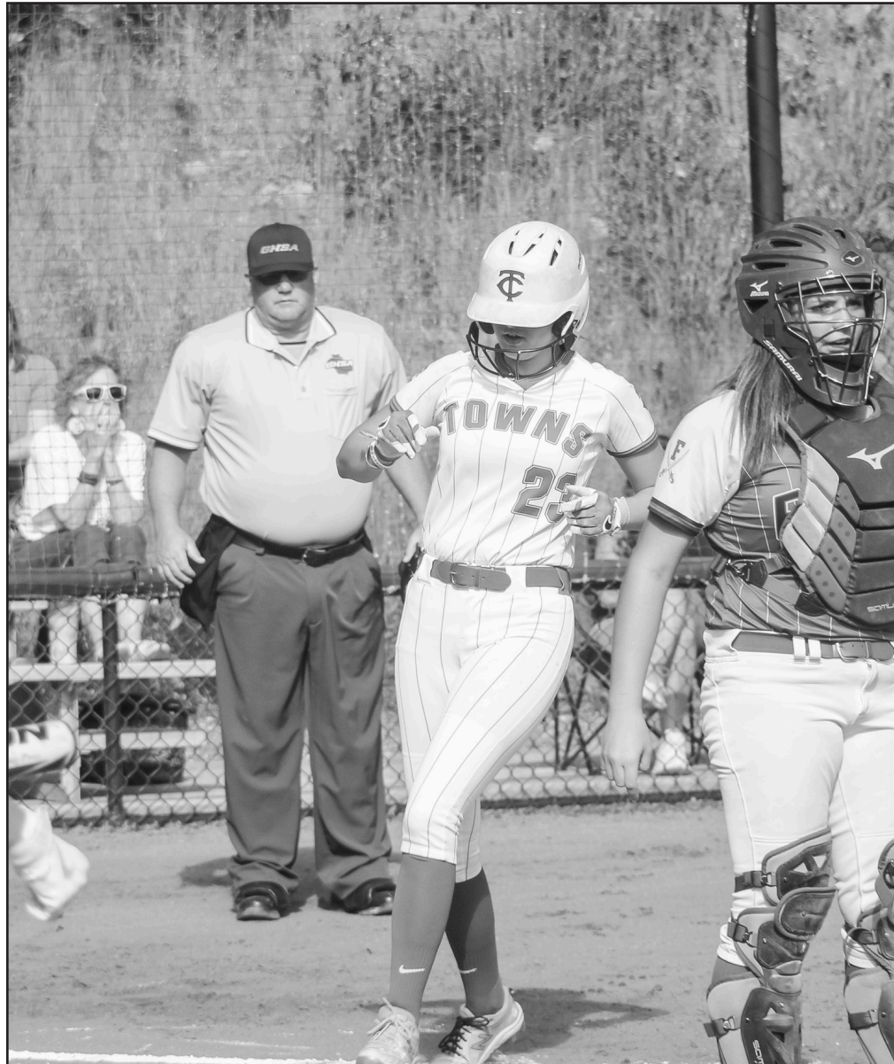
The Lady Indians prepare to face Gainesville at Lowell Nicholson Field.